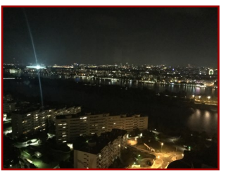
The Mesmerizing Danube

In summary, the congress afforded the attendees the unique opportunity to meet the luminaries, learn from their expereince, get exposed to the latest research and what technology has to offer, and provided ample networking opportunities. It certainly is unparallaled! Visit the ISUOG Website for details on the 2018 World Congress in Singapore!